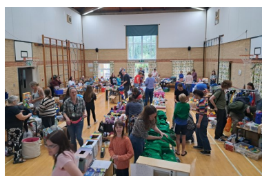
Friends 'Nearly New' Sale