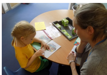
Reading volunteers in school

In particular, we have very a large number of parent volunteers who are supporting with individual reading sessions for pupils, something that we know is so important to support with phonics, comprehension and inference skills at every stage of reading development. This invaluable support is really making a difference. The fabulous 'Friends' committee are another, very visible, example of the commitment to support the school through volunteering - not just with after-school events like our cake sales, uniform sales and film/disco nights, but also at weekends. Last Saturday's 'Nearly New' sale was a great success and it was wonderful to see lots of pupils and families in attendance.