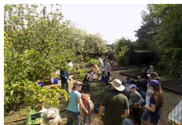
Allotment 'Volunteer' Morning

As a full-time working parent myself, I am very aware that not everyone has the capacity to volunteer time during the school day. I know this is the case for many of you, but know that you keep finding ways to offer your time and energy for the school above and beyond supporting your own child at home. So, whether you attend Friends events, are a school governor, have made a donation to the school, supported on trips or with individual reading, helped in class or anything else in between - thank you. It is all noticed and very much appreciated. By doing so, you are helping to make ESJ a fantastic school to be a part of.