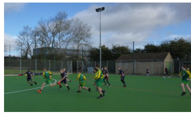
The Tag-Rugby team in action last week

Staying outdoors, I would also like to say a huge well done to our school sports teams who have already been in action this term. At every competition we attend, not only do our teams perform with great skill and teamwork, they are also always congratulated for their sportsmanlike attitude and conduct. At both the Girls Football and Tag-Rugby Ely district competitions this term, our teams have won their way through to the tournament final and been commended for their attitude and great teamwork - as always, 'we are proud to work together'.