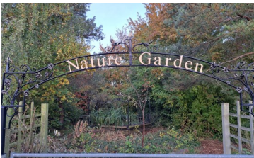
The new Nature Garden entrance arch

I am sure that many of you have seen the fantastic new archway that frames the entrance to our Nature Garden. A huge thank you to Adam's Forge of Littleport for all their time and work on this. Whilst this is just one of our many outdoor areas, it is one that showcases our belief in the outdoor curriculum and we hope that thousands of future children will walk under it and into a world of learning and discovery outdoors.