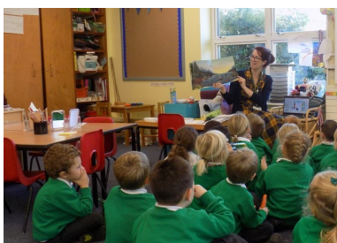
We love listening to stories!

My notes for the newsletter today have been inspired by some of the creative, imaginative and engaging ways in which I have seen children here at school taking part in different reading activities this week. I had the pleasure of leading a tour around the school with a prospective parent who commented to me just how much of a positive feel around reading there was in all of the classrooms we visited. Whilst it was lovely to get that feedback, I am very aware that the importance of reading both at school and at home cannot be overemphasised and it remains perhaps the most fundamental key to unlocking so much of the world of learning for our children.