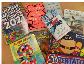
We love choosing books!

In terms of support from home, regular reading is essential to support development here in school - we would recommend five times weekly in most cases. Supporting your child with reading can take many forms, not just listening to them read. For younger readers, please do check out these great ideas from BBC Bitesize... www.bbc.co.uk/bitesize/articles/zbxby9q . For all children, as well as regular reading we would encourage lots of talk around the books they are reading - what are you enjoying about the book, what do you think might happen next, which character would you most like to meet? 'Book Talk' can of course happen anywhere, any time - even in the car on the way to the shops or on the walk to/from school! If you would like any ideas for book choices for your child or for any other support, please do get in touch with your child's class teacher.