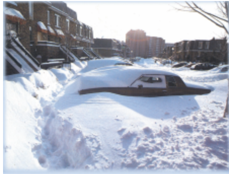
Snow drifts bury cars deep in snow

A strong snowy storm that lasts for three hours or more is called a blizzard. During a blizzard, it is extremely cold and heavy falls of snow and strong winds cause problems. It is difficult to see because there is so much snow blowing through the air. People have to dress in very warm clothes when there is a blizzard. This is because there is a danger of frostbite if suitable clothes are not worn. When a blizzard ends, cars often have to be dug out of deep piles of snow called snow drifts.