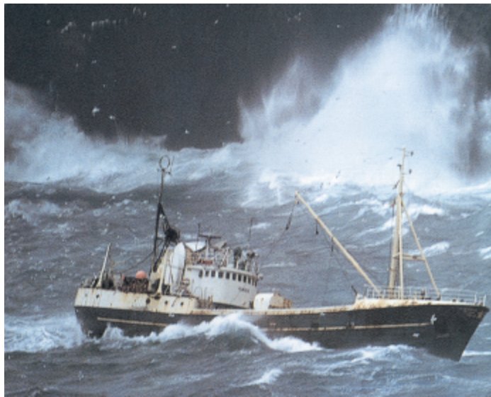
Storms at sea can be dangerous for boats.

Storms at sea can be dangerous for animals too. Young sea turtles and seals can be washed onto the shore during a storm. They are often caught up in seaweed. This makes it difficult for them to move back into the water when the storm is over.