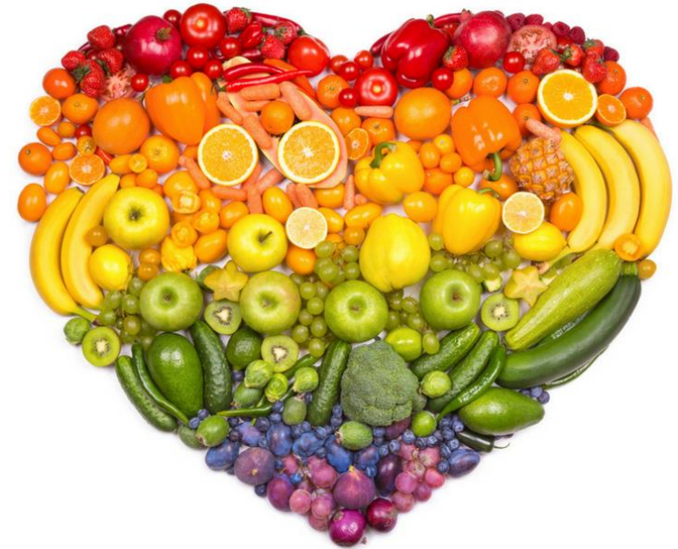
A fruit snack