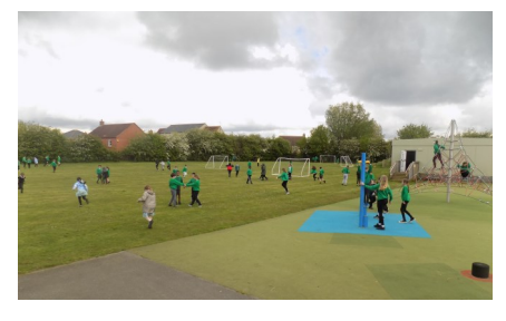
The field is open for playtimes at last!

At the very centre of what we are doing every term though is our relentless focus on engaging and inspiring the children to develop their learning in every way possible. Our EJ Way statement 'We are excited to learn new things' runs through the heart of everything. I have already seen that in evidence in all our year groups this term - with particular shout-outs to Year 6 for all their hard work in preparation for the upcoming Key Stage 2 tests in mid-May, and to Year 5 for all the very persuasive letters I received about school uniform earlier this week. Let's keep this up in the coming weeks and make this the very best term yet for fabulous learning and memorable experiences!