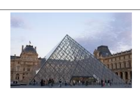
Louvre – a museum in Paris