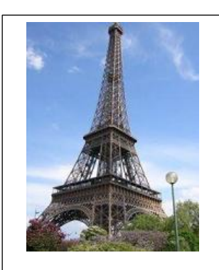
Eiffel Tower in Paris

The Pyrenées, a mountain range in the South of France, form a natural border between Spain and France. The highest mountain in France is Mont Blanc. It is 4,810 m/15780 ft high!