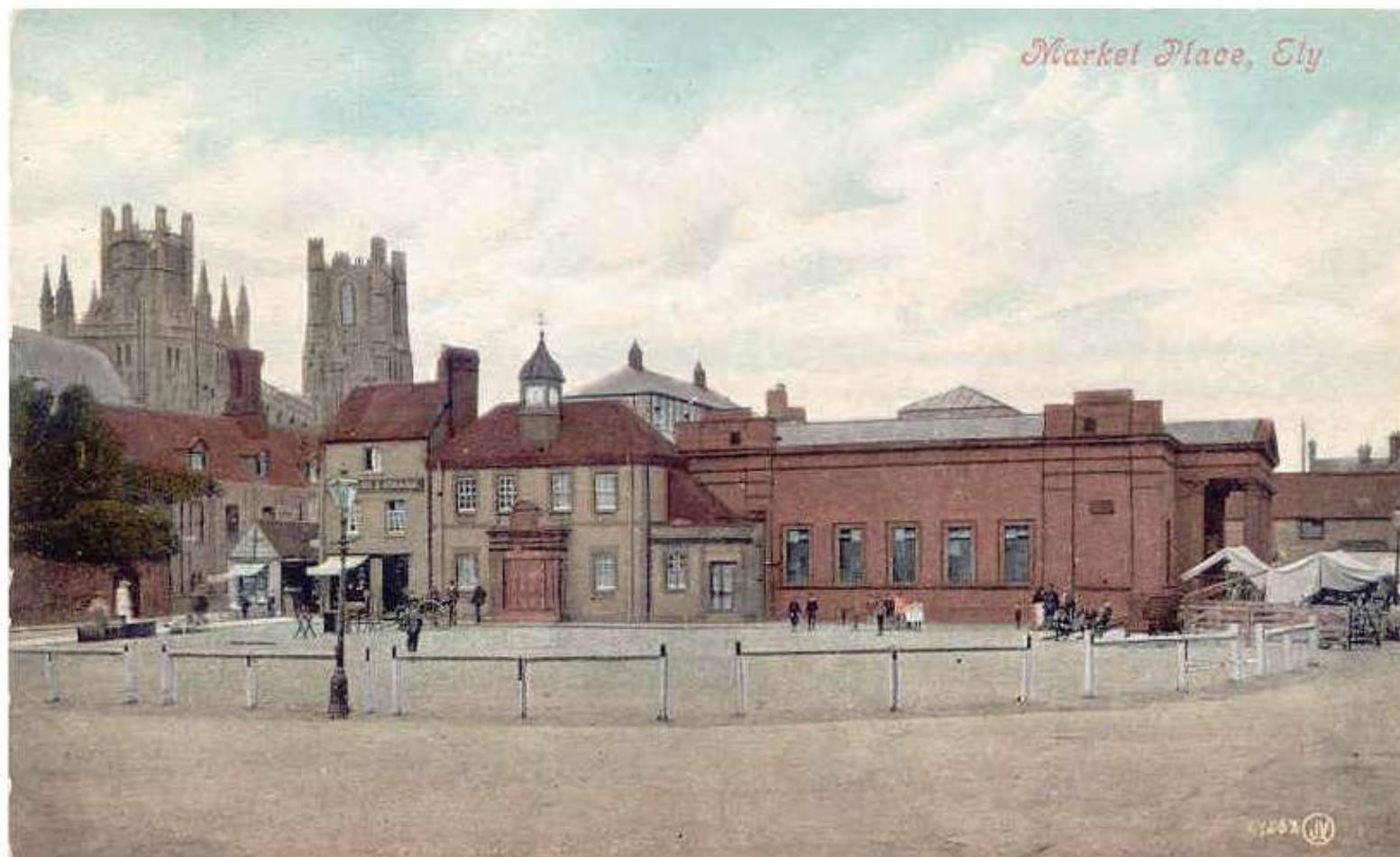
The Market Place Ely. The Market Place Ely