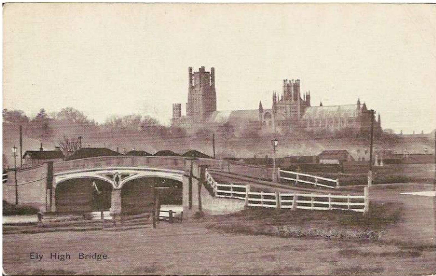
The High Bridge was built in 1833 to replace a wooden bridge. It has since been replaced with a concrete bridge.